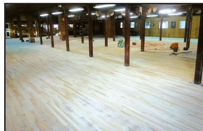
The Mess Hall is being remodeled!

You will see that we have continued to add many new things to our Danbee facility. The remodeled Mess Hall is coming along beautifully. Its renovation along with new tables is such a great change. We have added a gorgeous new porch to the fitness center where the campers can participate in our new program called POUND. Our theater has gotten a new roof. We have moved our low ropes course to Jacobe and now have a giant swing! A beautiful setting by the lake.